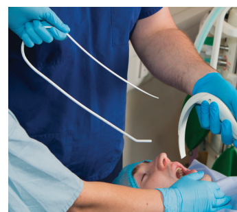
Universal Stylet Bougie (USB) in use