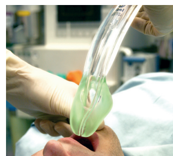
i-gel ® in use in anaesthesia

Accommodation will be at the Macdonald Windsor Hotel, located in the heart of Windsor town centre and opposite Windsor Castle, one of the official residences of the British Royal Family, and the oldest and largest occupied castle in the world. Windsor is situated approximately 20 miles west of London.